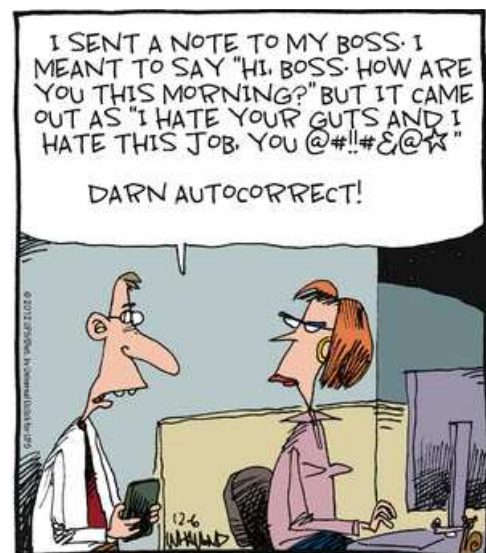
(Reality Check by Dave Whamond, 6 December 2012)