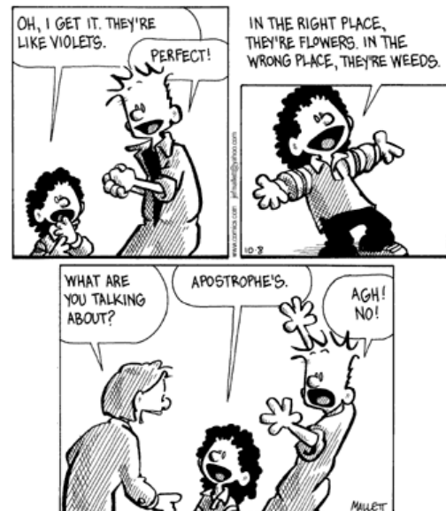
(Frazz by Jef Mallett, 8 October 2005)

We will, we will mark you! We will, we will mark you! (Stet?!) We will, we will mark you! (You can't do that!) We will, we will mark you! (Oh, I guess you can...)