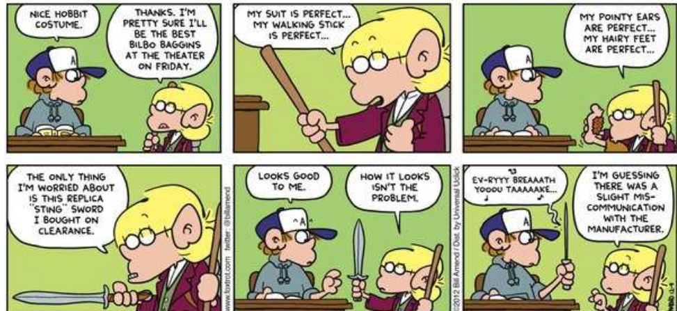
(Fox Trot by Bill Amend, 9 December 2012)