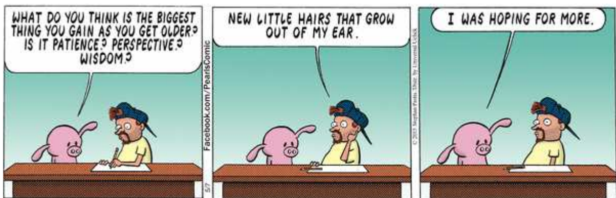
( Pearls Before Swine by Stephan Pastis, 7 May 2015)

TIME PASSAGES: Status report as of the first week of the New Year: I've been living for three solid decades in a century-old house; I'm married to a woman who has been alive for seven decades; I have a son who's almost one-third of the way through his fourth decade—if the figure were still of significance these days, he could celebrate his 33 1/3 birthday this coming May—and I'm closing in on what used to be considered retirement age (and it's still Medicare age). The bank that was my employer for nearly half my life has labeled me “retired” for 14 years. It's a good thing I don't feel that old. Usually.